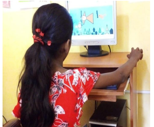
'She is drawing fish in an aquarium'

The Compute Center in Nuraicholai continues to provide free computer education to the children from poor economic background. Students in and around Nuraicholai attend the computer center.