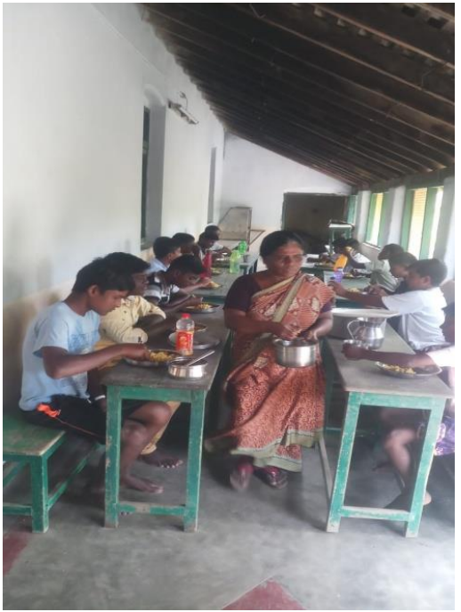
'Warden serving lunch'

During the lockdown, the child care workers were taking care of