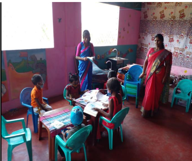
'Teacher interacting and teaching the children'