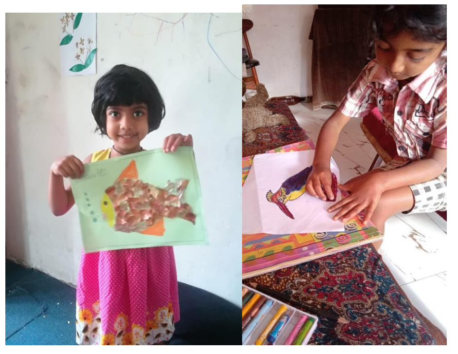
'She drew a fish'

The Children are healthy and active. They are happy to learn different fun activities that were taught to them on regular basis.