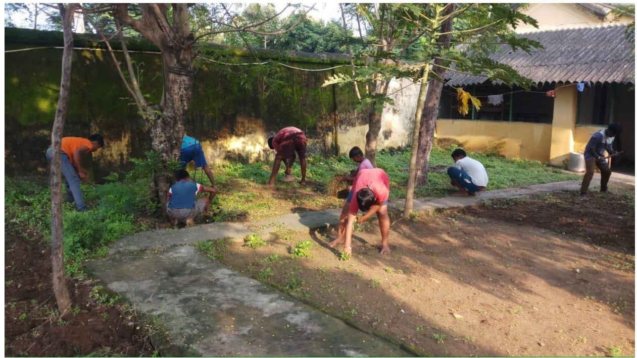
'Boys cleaning the home premises'