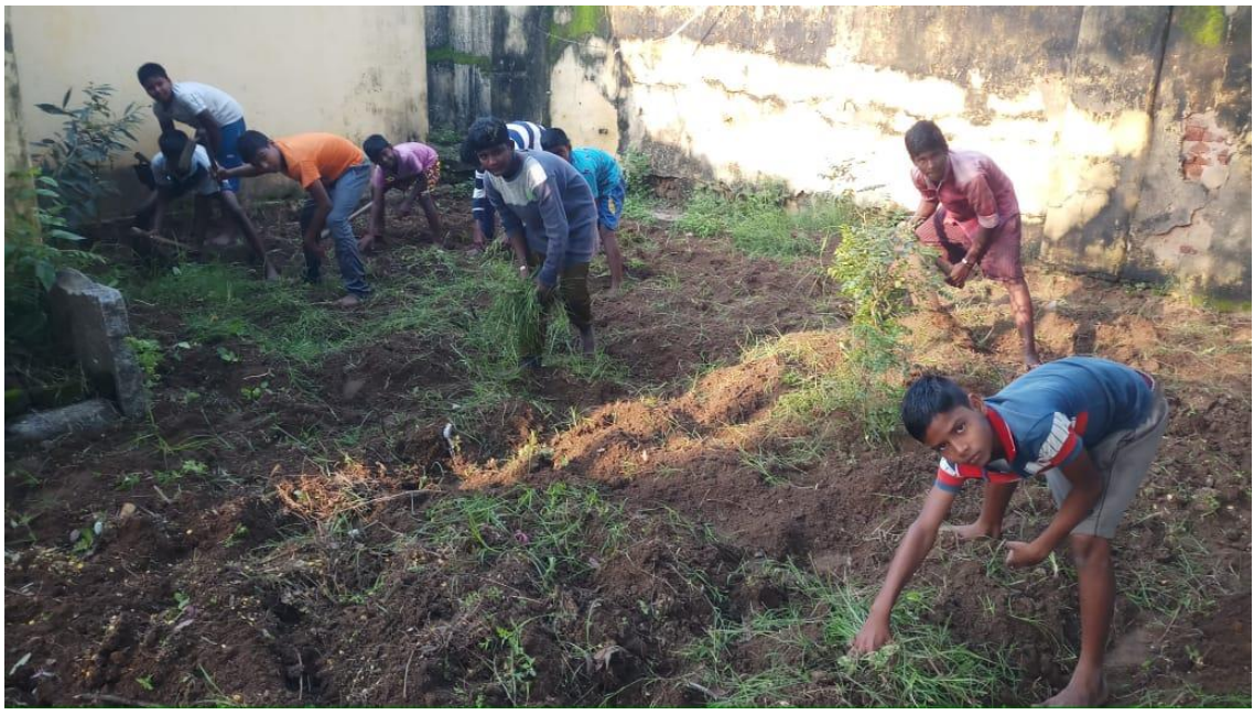
'Boys removing weeds and planting vegetables'