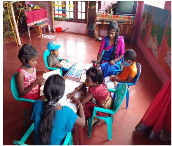
'Teacher teaching how to read'

The children were excited and happy to return back to school after lockdown. The Day Care Center continues to provide a perfect setting for active and energetic children who have outgrown the home environment.