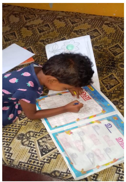
'Learning to write the alphabet'

The Day Care Center in Nuwara-Eliya was able to resume again after the lockdown. Students were happy and glad to join back at the Day Care Center.