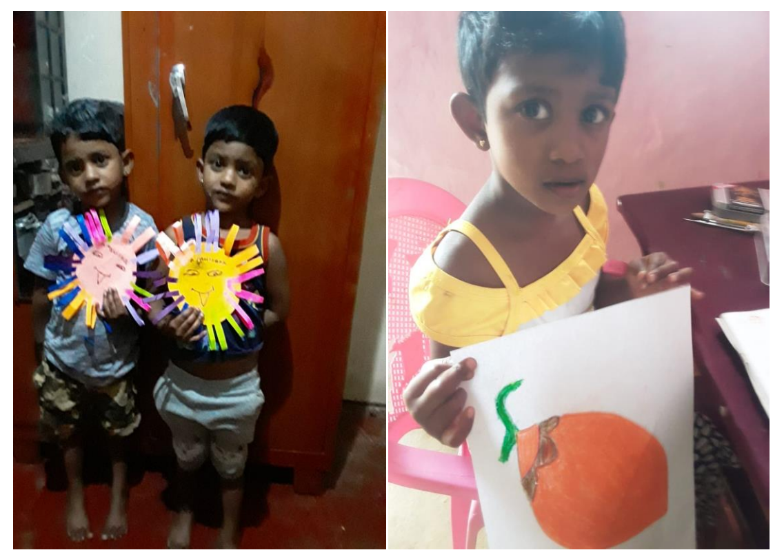
'Colourful pattern of the sun' 'Drawing and colouring a brinjal'

The Day Care Center in Nanuoya had to be closed for awhile and resumed later after the lockdown. The children were glad to be back after the lockdown. They were happy to see their friends and children. As usual, the day care center continues to provide them with lunch and snacks in the evening. They are served healthy and nutritious food. The children are healthy and active. They enjoy participating in traditional activities, games and drawing colorful patterns