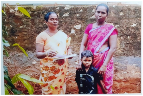
'Social Worker with the family'